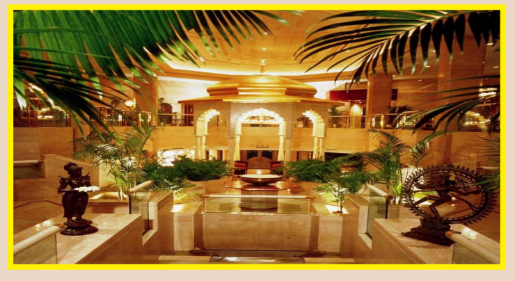
Lobby at The Leela Mumbai