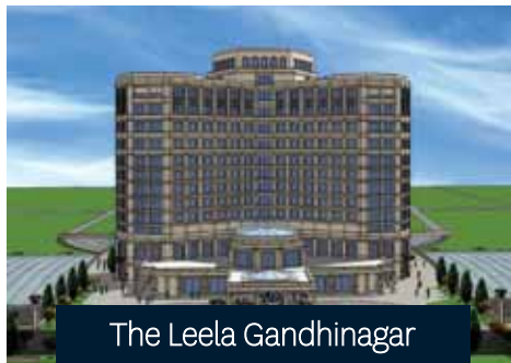
The Leela Gandhinagar