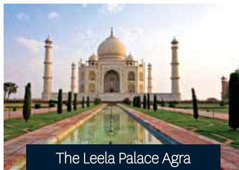
The Leela Palace Agra