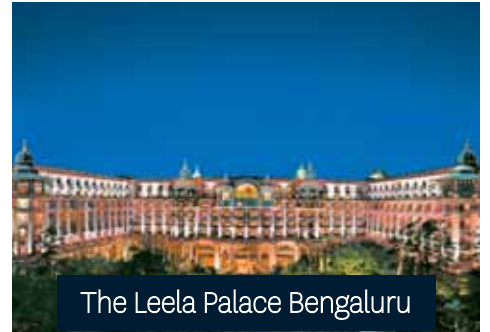
The Leela Palace Bengaluru