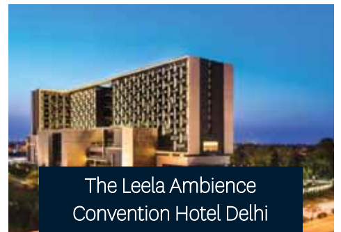
The Leela Ambience Convention Hotel Delhi