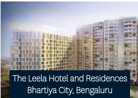
The Leela Hotel and Residences Bhartiya City, Bengaluru