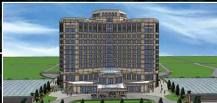
The Leela Gandhinagar, Gujarat scheduled to open in 2019

The Leela Palaces, Hotels and Resorts is pleased to announce that it has won the competitive bid and management contract to operate India's largest Convention and Exhibition Centre – the 34-acre Mahatma Mandir. Also, the group will be launching Gujarat state capital's largest hotel, The Leela Gandhinagar, a 300-room hotel that is being built within the complex. It is located close to the seat of the Gujarat Government as well as being easily accessible from the airport and key business districts of Gandhinagar and Ahmedabad. The project combines grand space with global standards of service and caters to the growing demand for world-class avenues.