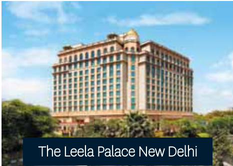
The Leela Palace New Delhi