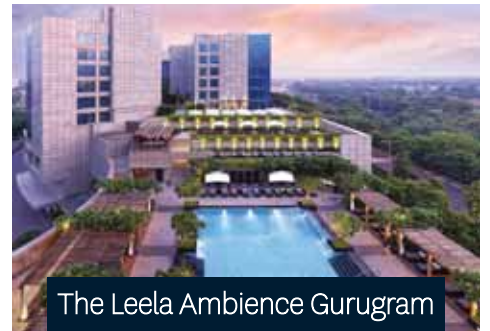
The Leela Ambience Gurugram