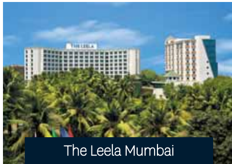
The Leela Mumbai