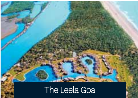
The Leela Goa