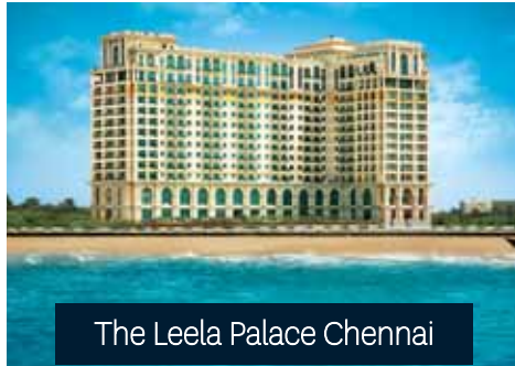
The Leela Palace Chennai