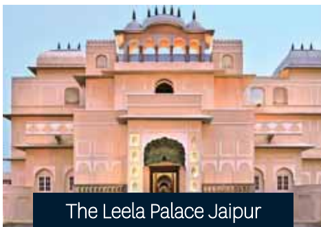
The Leela Palace Jaipur