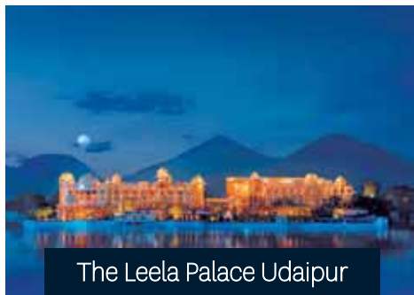
The Leela Palace Udaipur