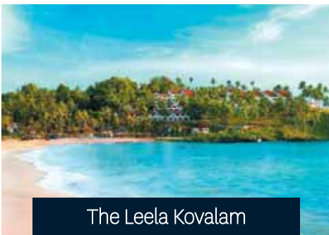
The Leela Kovalam