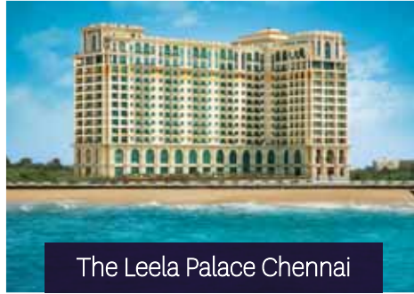
The Leela Palace Chennai