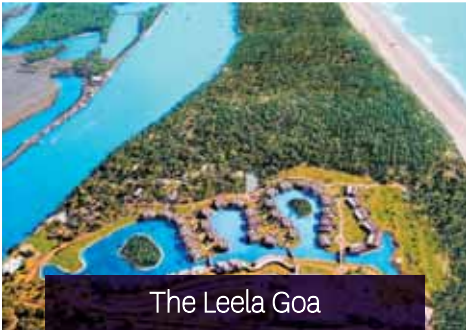
The Leela Goa