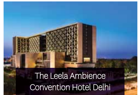
The Leela Ambience Convention Hotel Delhi