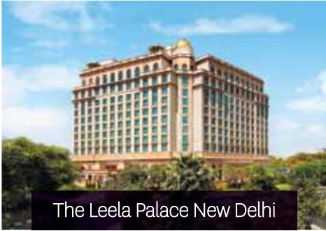
The Leela Palace New Delhi