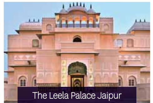
The Leela Palace Jaipur