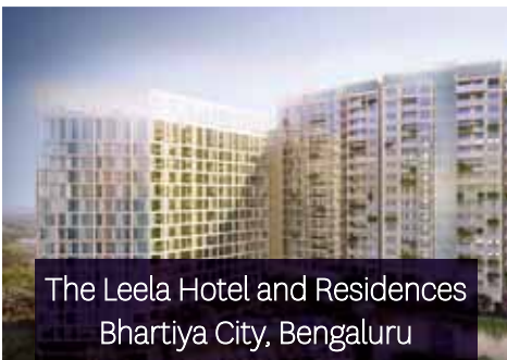
The Leela Hotel and Residences Bhartiya City, Bengaluru