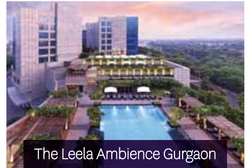
The Leela Ambience Gurgaon