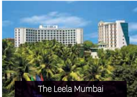
The Leela Mumbai