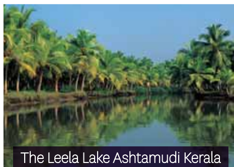
The Leela Lake Ashtamudi Kerala