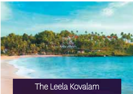
The Leela Kovalam