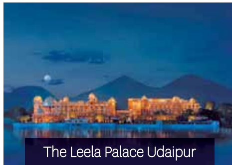
The Leela Palace Udaipur