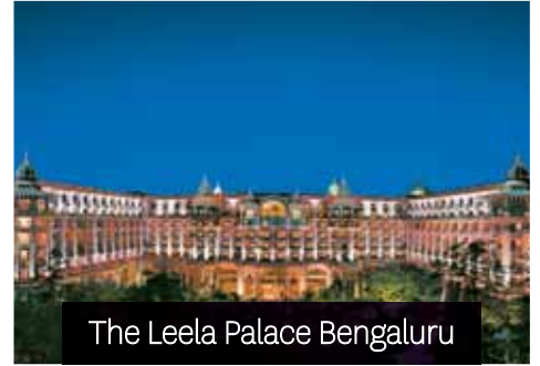
The Leela Palace Bengaluru