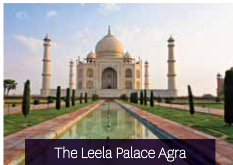
The Leela Palace Agra