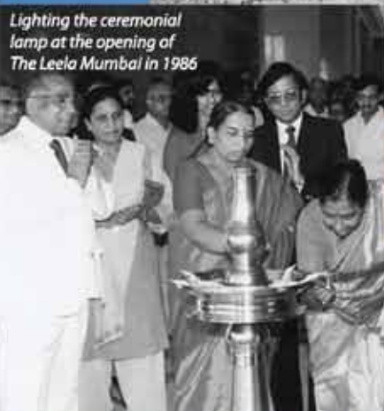
Lighting the ceremonial lamp at the opening of The Leela Mumbai in 1986