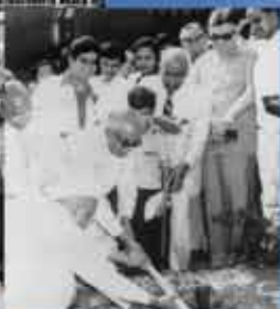
Late Shri Vasantdada Patil, former Chief Minister of Maharashtra at the foundation stone laying ceremony of The Leela Mumbai.