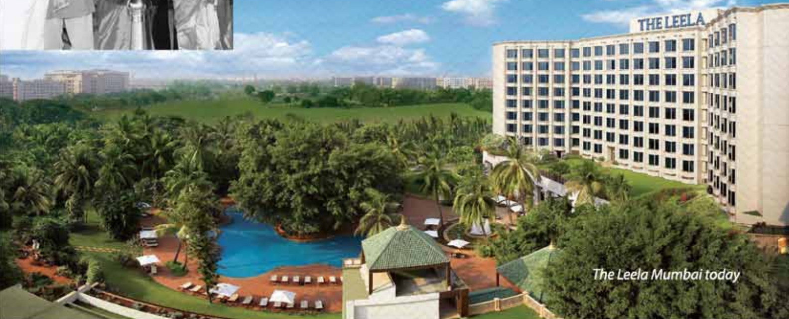
The Leela Mumbai today