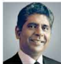
Mr. Vijay Amritraj