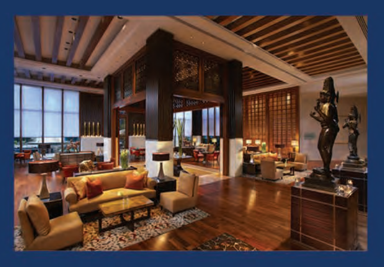
Lobby Lounge at The Leela Mumbai

To not just satisfy our guests, but delight them. To show the warmth and grace unique to Indian hospitality. To set a new global standard of service in which wishes are not simply granted, but anticipated.